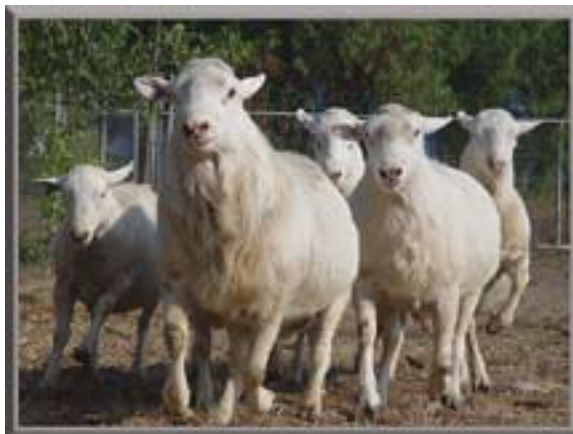
"Estampeda" Photography by Javier Lara, Queretaro, MX 2005 KHSI Photo Contest First Place - Action