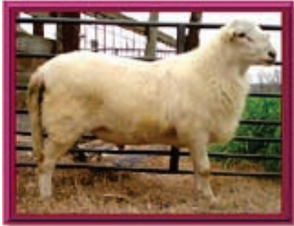
"MCD Pure Power" COR 05-22 Genotype RR, Twin, 226 lbs (1 year)

Country Oak Ranch is Introducing Two New Breeding Sires