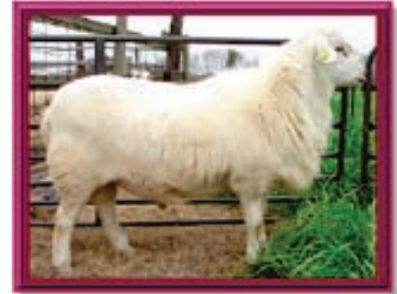
"MCD Southern Gentlemen" COR 05-54 Genotype RR, Twin, 217 lbs (1 year)

a limited number of their 2006 progeny will be available